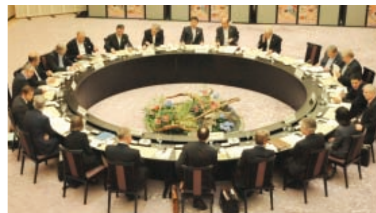
2008 G8 Foreign Ministers Meeting

Today, many companies based in Kyoto are actively involved in business with nearly 50 countries worldwide. In total these companies have more than 1,000 business bases outside of Japan and through this international network they are able to further develop their business worldwide. Though some companies started out as small venture business, they have grown dramatically based on a wide range of "wisdom" and high standard intellectual heritage with creative mind of Kyoto, and become large companies that are global leaders in their field of business. Kyoto is also known as an international convention city. Many important international conferences are held in the city every year. New knowledge and information is developed in Kyoto and sent around the world.