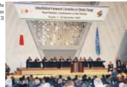
Third Conference of Parties to the UN Framework Convention on Climate Change in Kyoto (COP 3)

Kyoto has many universities and academic institutions. In close cooperation with other organizations, these centers of learning have produced original technological development methods and high-value added products or services for society. Kansai Science City, located in the southern part of Kyoto prefecture, plays an important role as a center of academic research where multiple “wisdom” from universities and research institutions are accumulated. Robotics, brain-machine interface, environment, biotechnology, light photon engineering, automatic translation systems of multiple languages, sensors, and many other research programs are actively taking place.