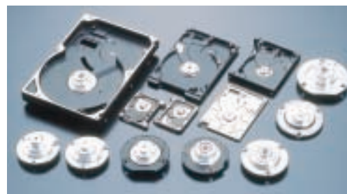
Spindle motors for HDD