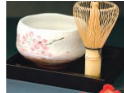
Tea ceremony utensils