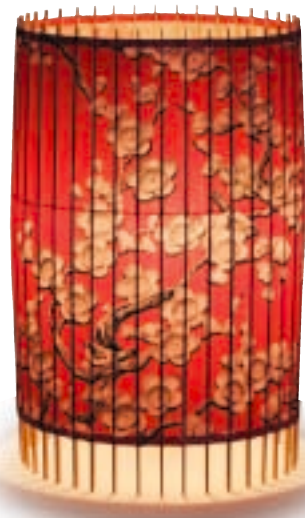
Japanese Umbrella Table Lamp