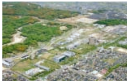
Kansai Science City Seika-Nishikizu District of Kansai Science City (Photographed in 2012)