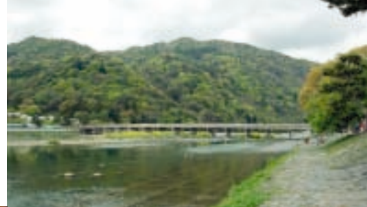
Togetsu-kyo Bridge in Arashiyama