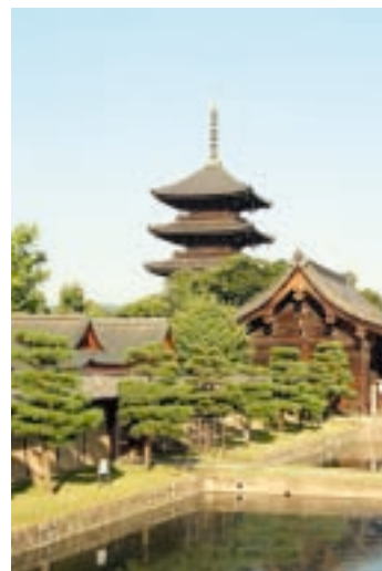
Five-story pagoda of To-ji Temple