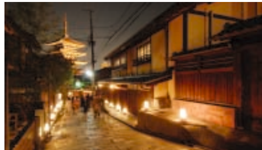
Kyoto Higashiyama Hanatouro, night-time illumination