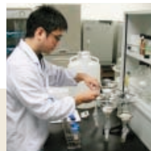
Filtration of vegetable extracts