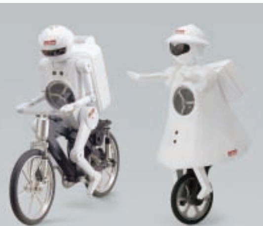
MURATA BOY © MURATA GIRL™

In Kyoto, there are many high-technology industries which developed from the precision techniques and unique management methods of the city's many traditional industries. A long history of innovative business approaches has led to the successful foundation of many new businesses. Cutting-edge industry and traditional industry exist side by side in Kyoto. When Kyoto's "wisdom" is added to Kyoto's unique industry structure, new business models are developed. Often these business models focus on the small lot production of a variety of products characterized by high added value. These cutting edge industries compete on a global level and are the center of Kyoto's economy today.