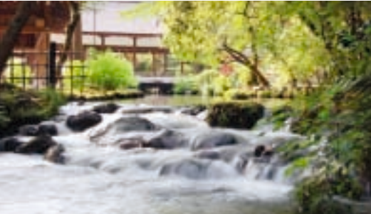
Clear stream in Kamigamo Shrine