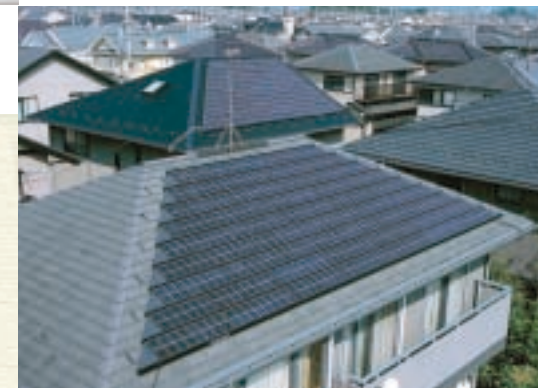
Kyocera Photovoltaic Modules © KYOCERA Corporation