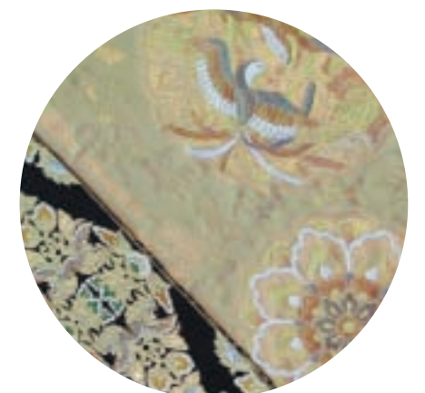
Closeup of Nishijin textile