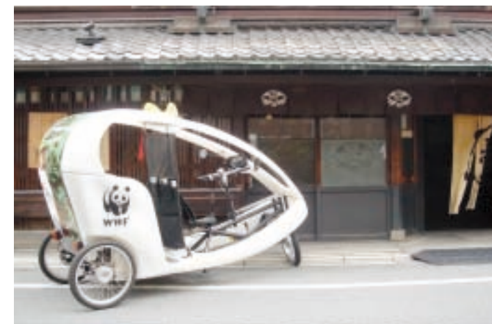
Japan's first velo taxi started in Kyoto

Kyoto hosted the Third Conference of Parties to the UN Framework Convention on Climate Change (COP 3) in 1997 and the city is the place where Kyoto Protocol was adopted. There are a number of businesses in Kyoto that are globally active in the environmental industry. These businesses are actively developing technologies for a better environment. Innovations in this field include environmental measurement, analytical equipment, solar batteries, CO2 absorbing material and efficient energy management. All kinds of “wisdom” accumulated in Kyoto has resulted in the creation of a “model city for a sustainable society” which is environmentally advanced and where the environment and the economy exist in harmony.