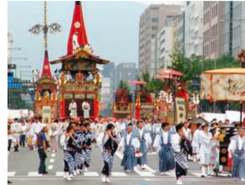
Grand parade in the Gion Festival

Kyoto, with its 1,200-year history and its abundant natural surroundings, has created a wide range of culture and tradition. Kyoto is a treasure house of the “wisdom” of its citizens that includes many World Heritage Sites, festivals and traditional entertainment forms. Kyoto welcomes more than 70 million visitors from Japan and the world every year. It is our task to preserve and nurture the city's historical scenery and traditional culture and to promote this ancient city's attractions to the world.