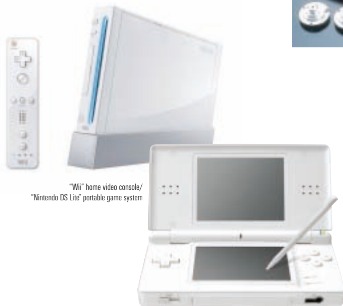
"Wii" home video console/ "Nintendo DS Lite" portable game system