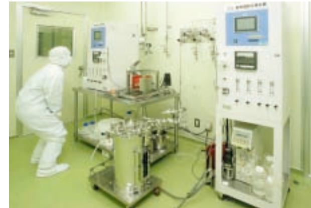
Center for cell and gene therapy