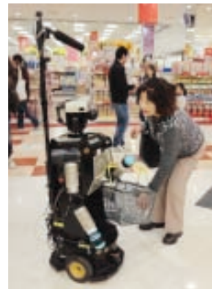
Shopping Support Service with Robovie