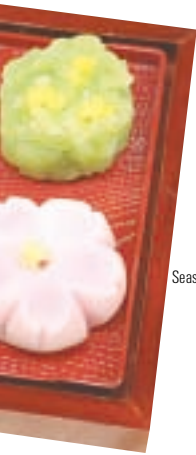
Seasonal Japanese sweets