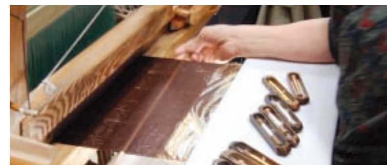
Weaving Nishijin textile

Kyoto can be proud of its excellent traditional craft industries including world famous Nishijin textiles and Kiyomizu ceramics. Based on tradition and culture, local crafts people have improved their products using their "wisdom" in life. New forms of science, technology, skill and design have developed from the foundations of the city's traditional industries. When traditional elements and new "wisdom" are combined, new lifestyle products for clothing, eating and living are created that are sophisticated, beautiful and unique.