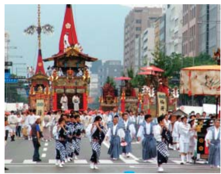
Grand parade in the Gion Festiva