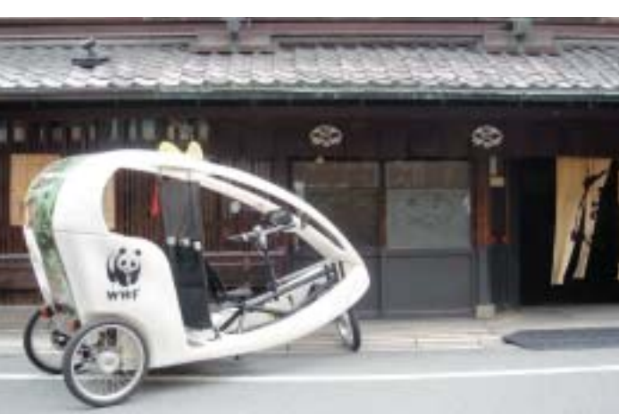
Japan's first velo taxi started in Kyoto