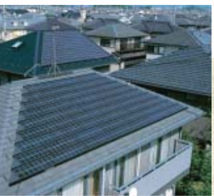
cera Photovoltaic Modules KYNCERA Cornoration

Kyoto hosted the Third Conference of Parties to the UN Framework Convention on Climate Change (COP 3) in 1997 and the city is the place where Kyoto Protocol was adopted. There are a number of businesses in Kyoto that are globally active in the environmental industry. These businesses are actively developing technologies for a better environment. Innovations in this field include environmental measurement, analytical equipment, solar batteries, CO2 absorbing material and efficient energy management. All kinds of "wisdom" accumulated in Kyoto has resulted in the creation of a "model city for a sustainable society" which is environmentally advanced and where the environment and the economy exist in harmony.