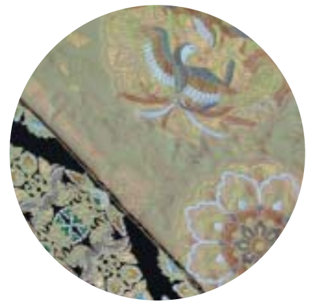
Closeun of Nishiiin textil