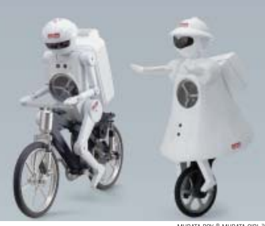
MUBATA BOY <sup>®</sup> MUBATA GIRI © Murata Manufacturing Co., Ltd

Kyoto, which became the capital of Japan in 794, is, more than any other city in Japan, symbolic of the ideal essence of Japanese culture. Moreover, the city is without question one of the world's most famous tourist centers. Over the past 1,200 years, however, it has also been a powerful and productive economic center. Today, Kyoto has the highest market share of any Japanese city related to creativity and the wisdom for a better future: ecologically, artistically, and in the changing world of high technology.