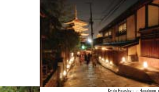
Kvoto Higashiyama Hanatouro, night-time illumination